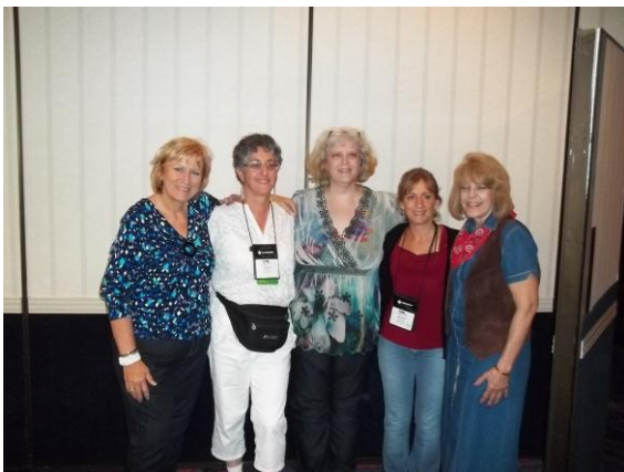
Minneapolis members catch up w/ some former members